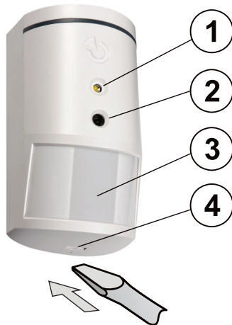
Figure: 1 – flash for illumination; 2 – camera lens; 3 – PIR detector lens; 4 – cover tab;

The detector can be installed onto a wall or in the corner of a room. There should be no obstacles which quickly change temperature (electric heaters, gas appliances, etc.) or which move (e.g. curtains hanging above a radiator) or pets in the detector's field of sight. It is not recommended to install the detector opposite to windows or floodlights or in places with over-intense air circulation (close to ventilators, heat sources, air conditioning outlets, unsealed doors, etc.). There should be no obstacles in front of the detector which might obstruct its view.